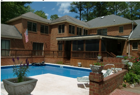
Back side and pool of the Only Facility of its kind in the world.