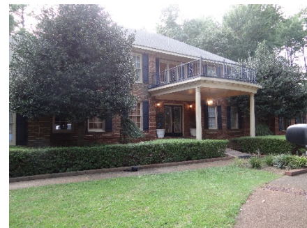
Main Building of the Retreat Center

a very small group for an immersion Internet Marketing and video production weekend.