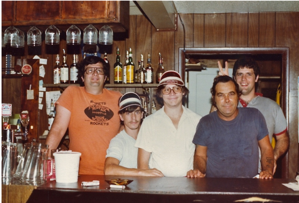
The Anchor Lounge circa 1983. That's me making the bunny ears over one of the employees.

made deals with all the creditors to give me time and I paid off every last penny. I was not about to screw over people who had trusted in me.