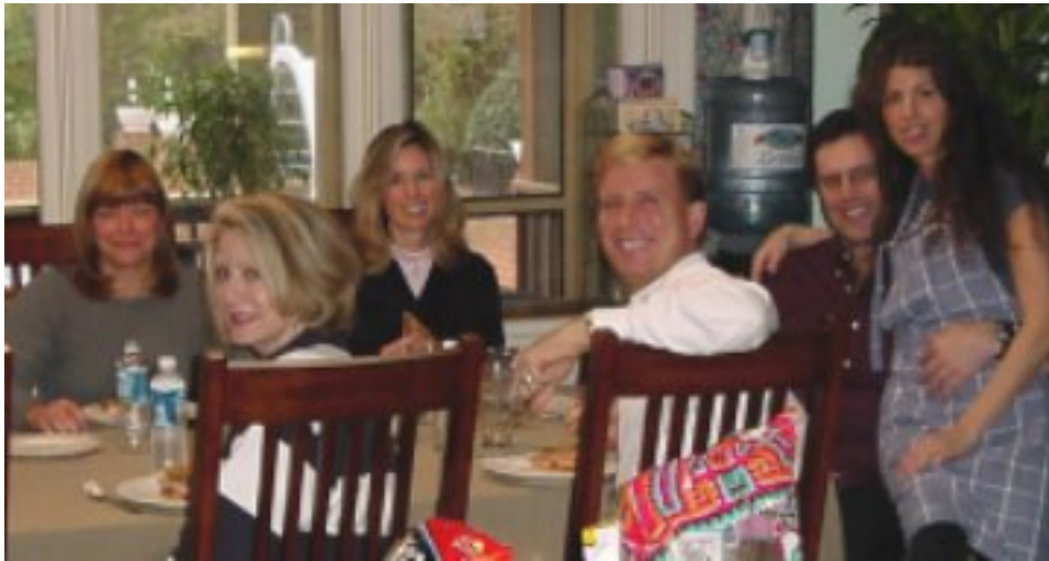
Breakfast at the Retreat Center

Retreat Center Visit – Included in your mentorship is an immersion weekend for you and a family member at the Great Internet Marketing Retreat Center where