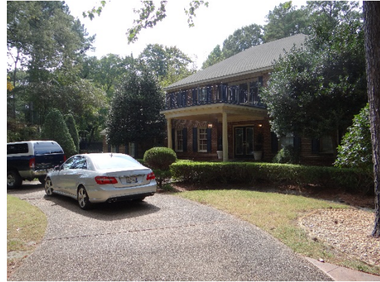
Retreat Center where you'll stay.