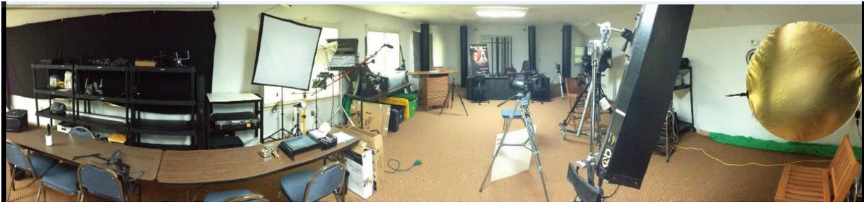
Panoramic view of our production studio.

Plus , you learn lighting and equipment and how to use them. Also, my video guy has written three books on YouTube marketing so you will learn how to maximize YouTube.